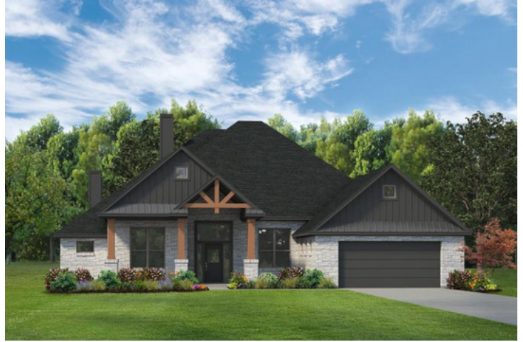
2720 Elevation E

All other Abbott floor plans and elevation images are currently being built in our system. Images shown above may not reflect the actual product. Multiple elevation options will be available soon. Please contact us if you have any questions.