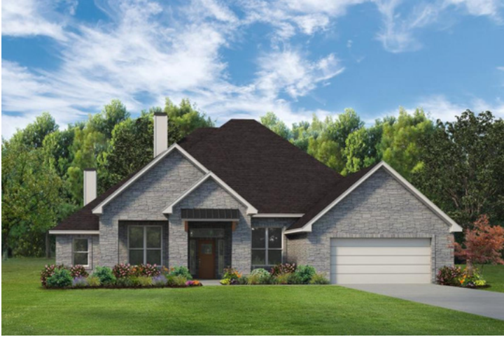
2720 Elevation D